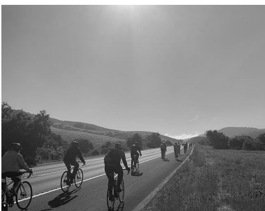
beautybylevi - Some of the gorgeous views on day 6. #aidslifecycle